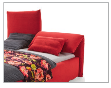
HIGH-QUALITY FUNCTIONAL BACK