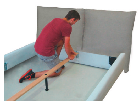
Angles for side panels. Insert depth of slatted frame is height-adjustable from approx. 12,5-22 cm.

8. Mount centre support rail at connectors of headboard and foot part at desired height and adjust supporting foot at the floor height. Start with the side of head part. If it is not possible to mount the centre support rail, slightly loose the screws of corner angles at foot part. After connecting of centre support rail tighten the screws again.