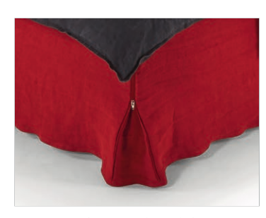
REMOVABLE SLIP COVER WITH ZIPPER