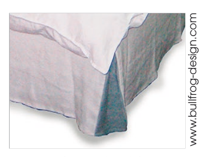
REMOVABLE SLIP COVER WITHOUT ZIPPER