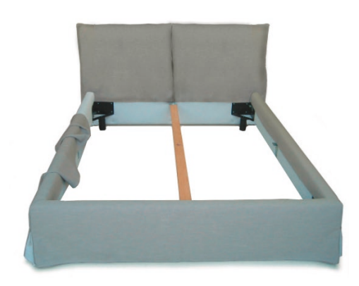
12. After you have placed the cover properly onto the corpus, remove the velcro (soft side strap) carefully and fix the cover.

(Do not yet remove the soft side strap of velcro!)