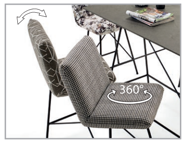
Rotation function (360°) and individual back adjustment