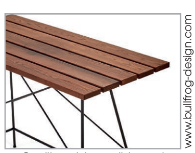
Quality outdoor solid wood in different wood variants or concrete table top