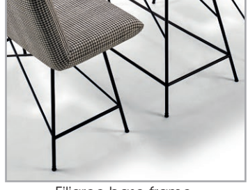
Filigree base frame, metal, powder-coated fine structure in black matt