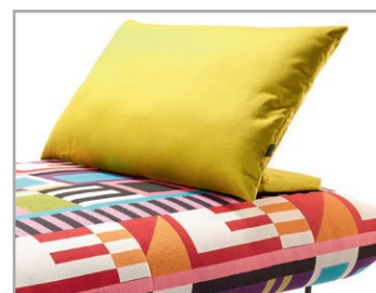
Variable positioning Moba, functional cushion in different sizes