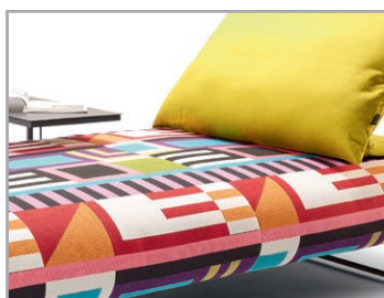
Soft sitting comfort