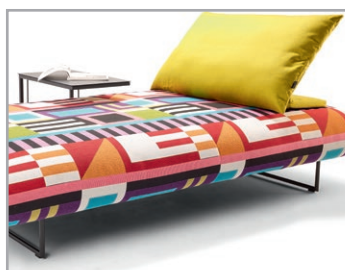
Cushion look on filigree skirts, variable placeable in the room