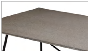
Example: 2204 Mamamia, concrete surface